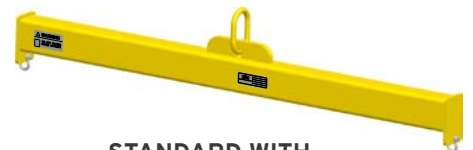
STANDARD WITH SHACKLES