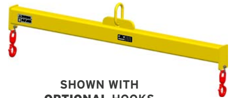
SHOWN WITH OPTIONAL HOOKS