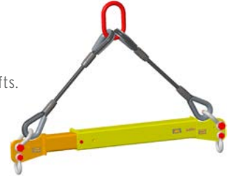
SHOWN WITH OPTIONAL TOP RIGGING & SHACKLES